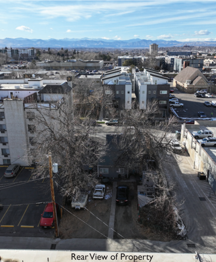
Rear View of Property