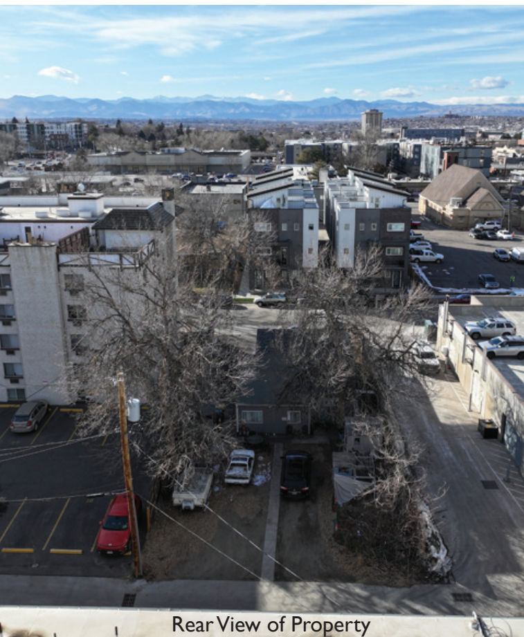
Rear View of Property