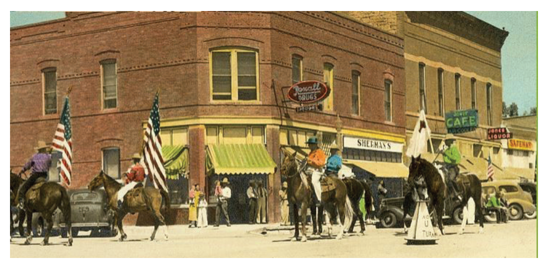
An undated picture showing the property as a Rexall Drug Store.

An undated picture showing the property as the First National Bank