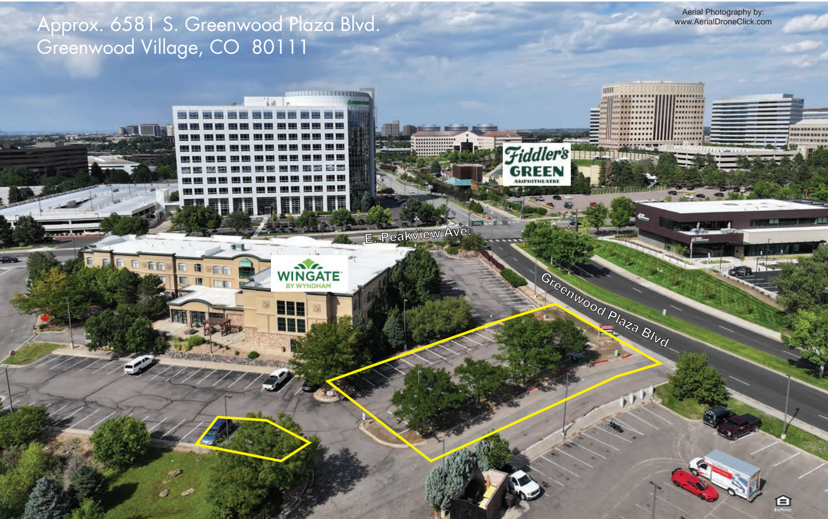
Boundary lines presented as a visual reference only and may not be accurate. Consult broker for legal description and easement agreements.