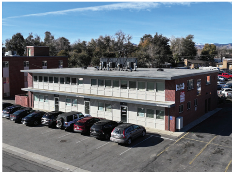
1455 Ammons St.