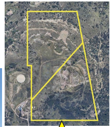
Approx. location & direction of photo.

Demographics are centered at the Whole Foods store on the west side of the highway.