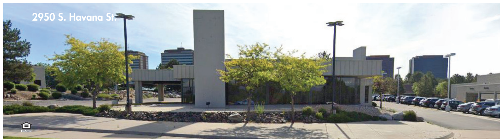
2950 S. Havana St.