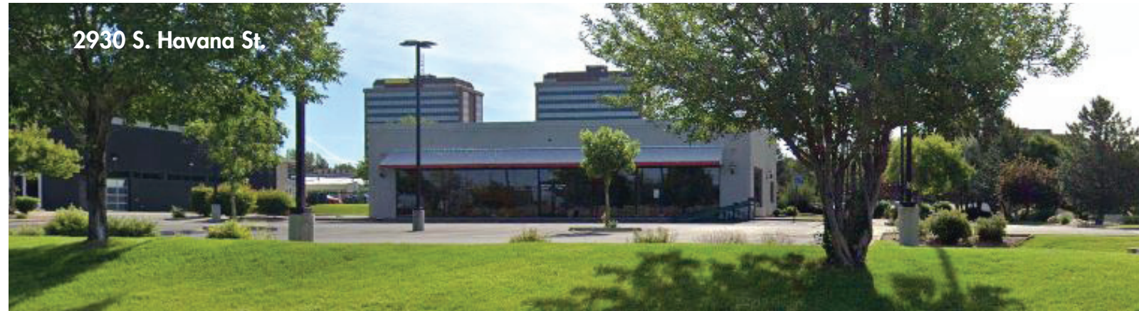
2930 S. Havana St.