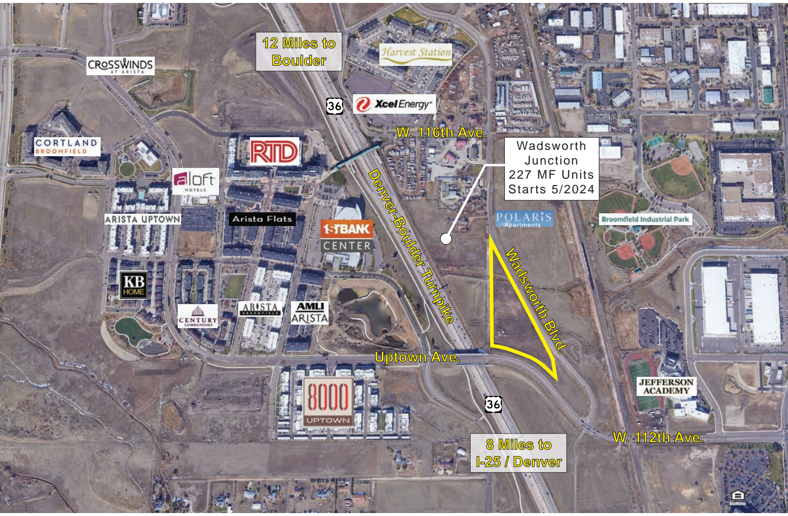
Boundaries presented as a visual reference only. Consult broker for complete legal description. Aerial photographs not available due to proximity to nearby airport.