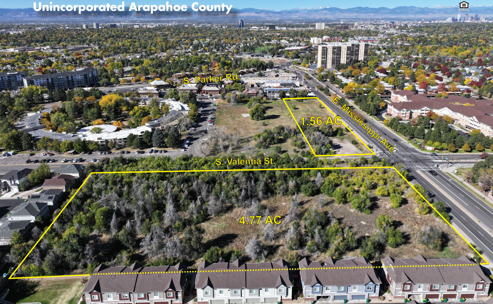
Boundaries presented as a visual reference only. Consult broker for complete legal description.