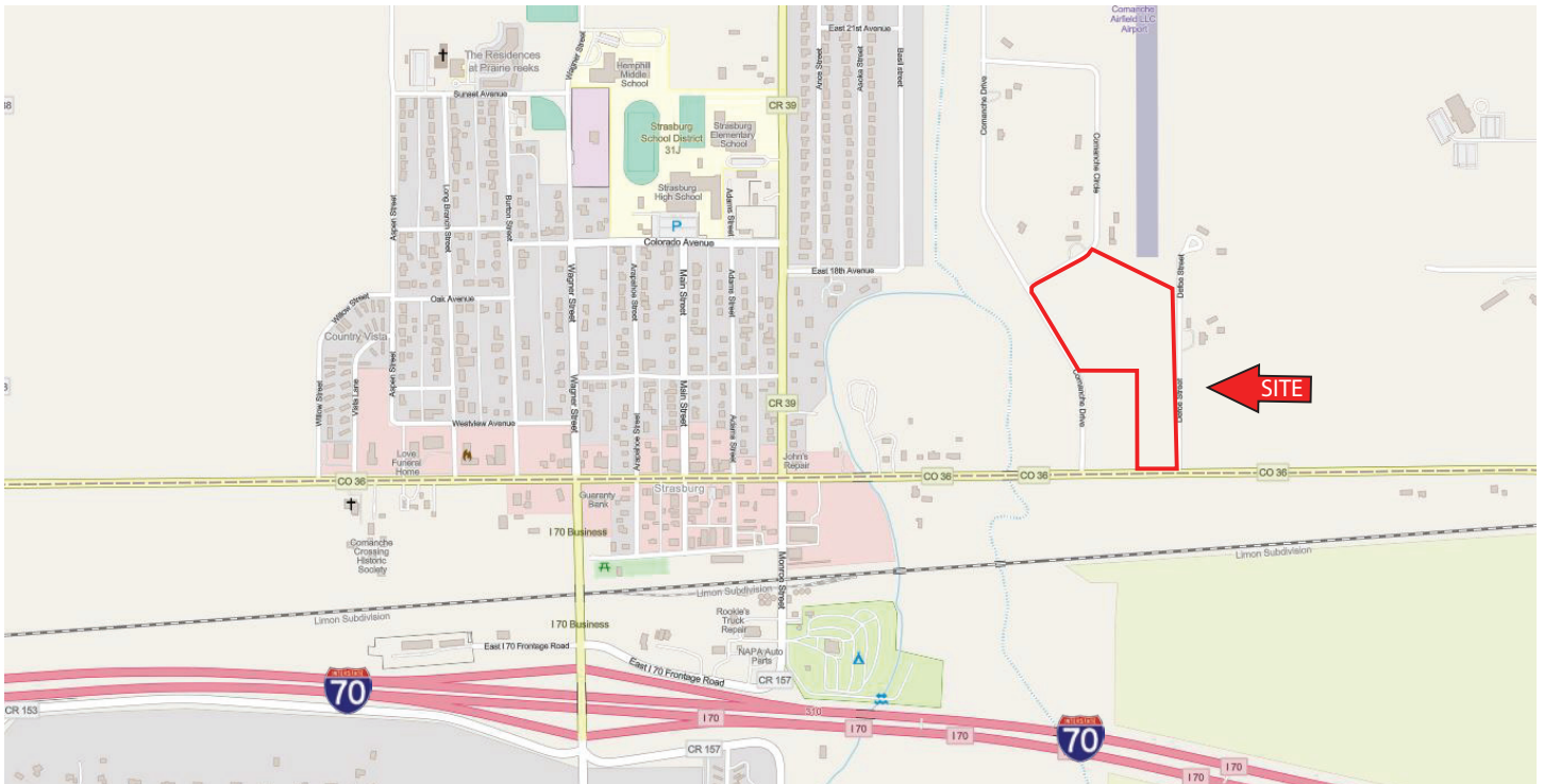
Corner of E. Colfax Ave. & Comanche Dr.