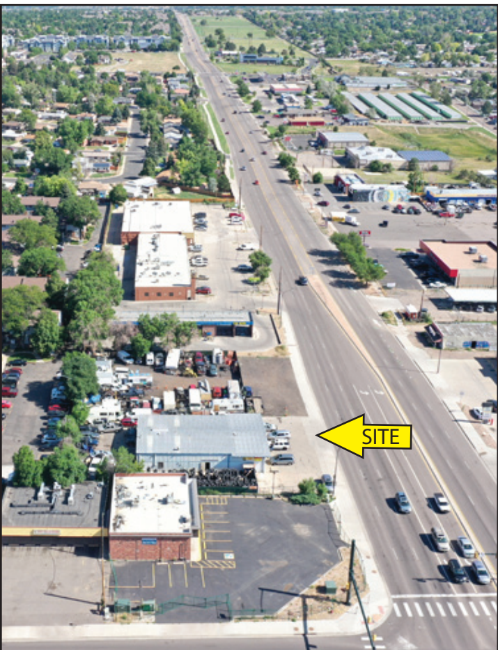
Looking North down Federal Blvd.