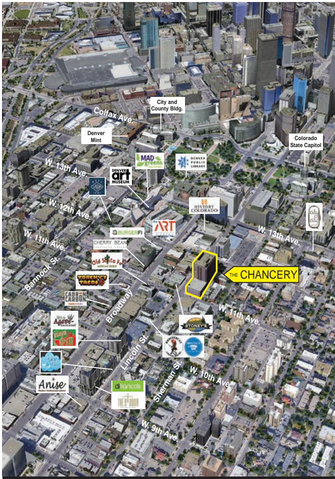
Traffic Counts: Lincoln St @ 12th Ave 29,594 vpd