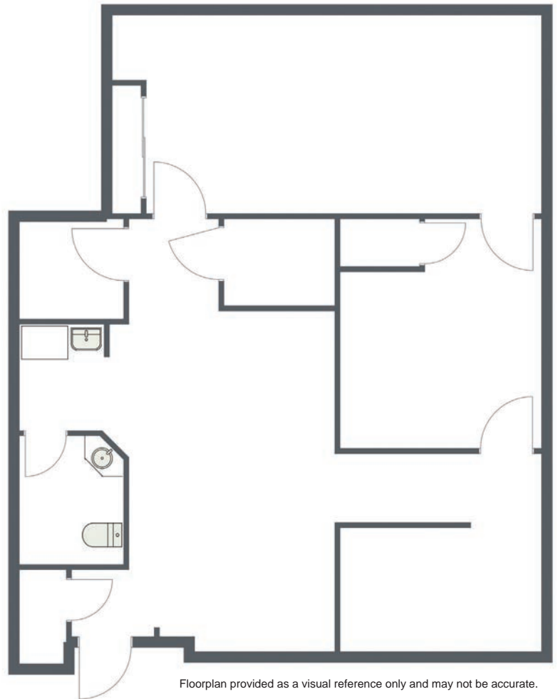
Floorplan provided as a visual reference only and may not be accurate.