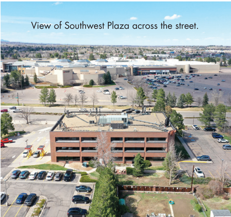
View of Southwest Plaza across the street.