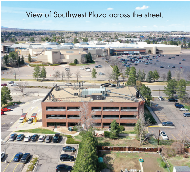
View of Southwest Plaza across the street.

Floorplans provided as a visual reference and may not be accurate.