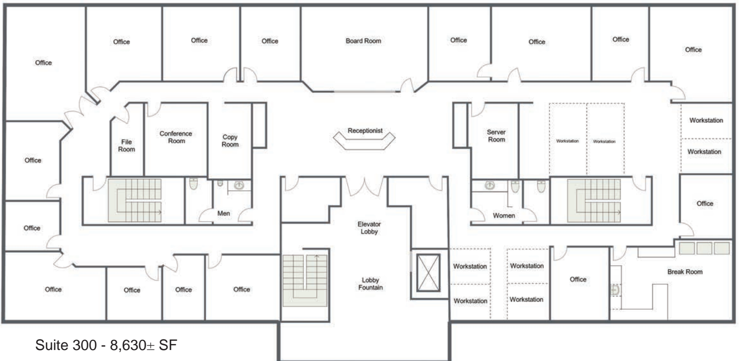
Suite 300 - 8,630± SF

Traffic: 27,375 -S. Kipling Ave. @ S Chafield Ave.