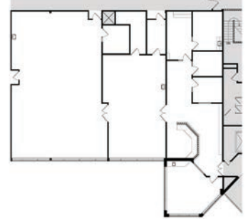
Suite 260 5,771 RSF