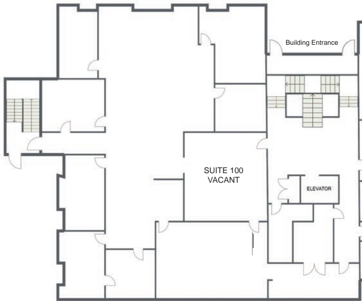
Floorplans provided as a visual reference only and may not be accurate.