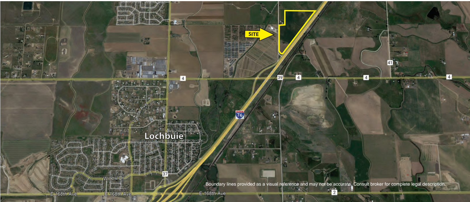
Boundary lines provided as a visual reference and may not be accurate. Consult broker for complete legal description.